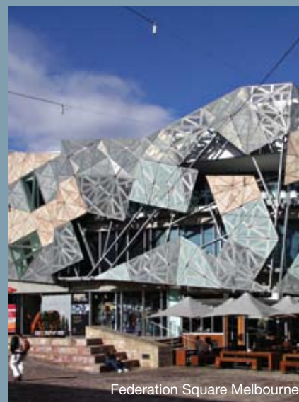
Federation Square Melbourne