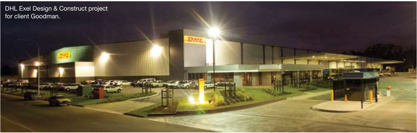
DHL Exel Design & Construct project for client Goodman.