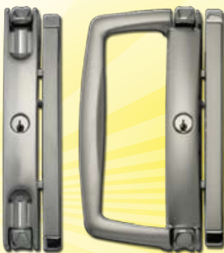
Sliding Patio Door Locks

Handles Rollers Winders Stays Locks Hinges