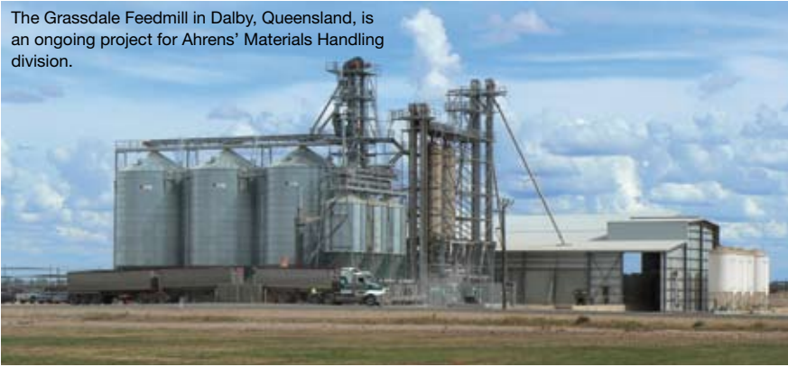
The Grassdale Feedmill in Dalby, Queensland, is an ongoing project for Ahrens' Materials Handling division.

SUSTAINABILITY IS A KEY FACTOR IN THE DESIGN OF THE NEW PLANT, WHICH INCORPORATES A WATER TREATMENT RECIRCULATION PLANT TO ENSURE THE PAINT SHOP CREATES MINIMAL WASTE PRODUCTS.